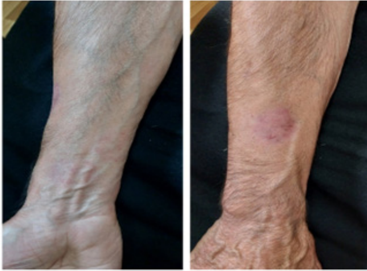
Figure 2. Changes on the skin in regression one month after starting systemic therapy with fluconazole.

was initiated along with topical application of terbinafine (Lamisil 10 mg/g cream, GSK Consumer Healthcare SARL) and local hair removal. The subsequently received culture for dermatophytes and yeast, after 14 days of cultivation, returned negative. Significant regression of changes on the skin was observed after one month of therapy. Discreet, pale erythematous plaques, predominantly on the extensor of the forearms have remained. Itching was less intense. Liver enzyme levels were within reference ranges before initiating therapy and during therapy with systemic antifungals.