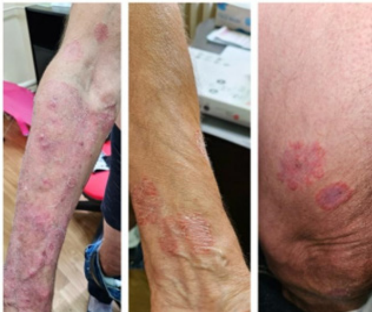
Figure 1. Skin changes in the form of erythemasquamous plaques, partially confluent and single, annular erythematous plaques with pronounced peripheral edges and central signs of regression. The changes are a reflection of the ten-month application of topical corticosteroid therapy.

A mycological examination of the skin lesion was conducted, and the direct mycological finding was positive. Systemic therapy with fluconazole (Diflucan caps a 50 mg, Fareva amboise) at a dose of 50 mg daily