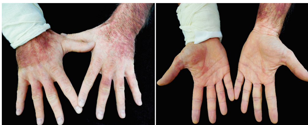
Figure 3. Maculopapular skin rash - dorsal side of the hands, erythematous macules - palmar side of the hands

The patient was diagnosed with DRESS syndrome with involvement of the skin and liver, and systemic therapy with corticosteroids (methylprednisolone at a dose of 1.5 \text{ mg/kg} ), antihistamines and antibiotics (ceftriaxone according to the antibiogram) was prescribed, along with supportive rehydration therapy with crystalloid solutions, hepatoprotective and local indifferent therapy with emollients. The dose of corticosteroids was gradually reduced with the transfer to oral prednisone therapy at a dose of 0.5 \text{ mg/kg} one month after introduction. Corticosteroid therapy was completely stopped after a total of 3