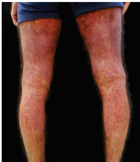
Figure 2. Maculopapular skin rash, posterior side of the legs

was cultured from the throat smear, while nose, throat, urine and blood cultures were negative.