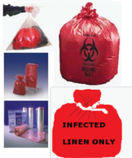
Figure 1. New Procedure for the treatment of hospital laundry [30]

Bags are supplied interleaved on a roll reducing the risk of dispersing airborne viruses during dispensation. Laundry bags are available in several sizes in clear or red (Figure 1).